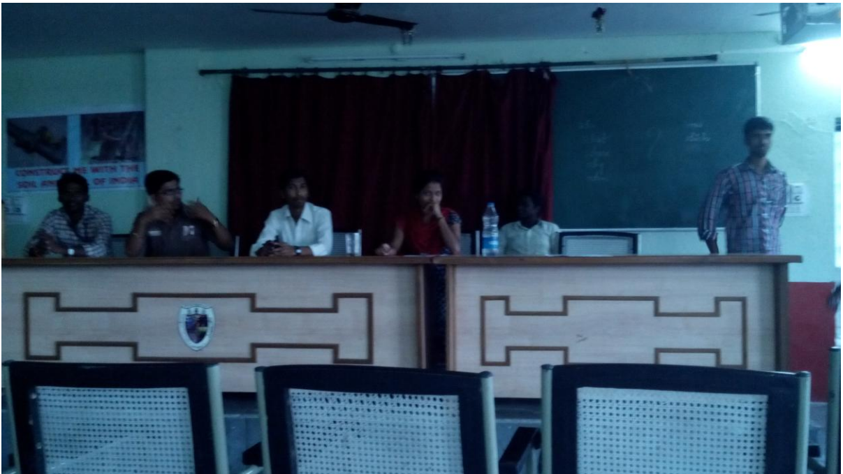
Glimpses of Students introducing themselves – Self-Introduction(2014)