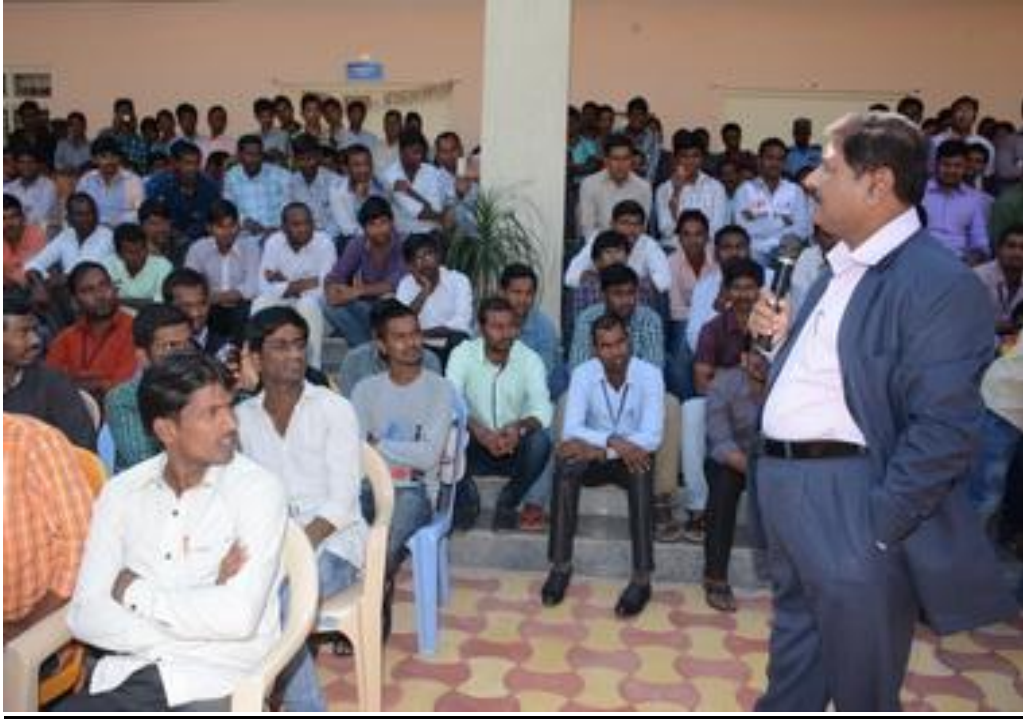
HON'BLE VICE-CHANCELLOR INTO THE STUDENTS GATHERING WHILE ADDRESSING